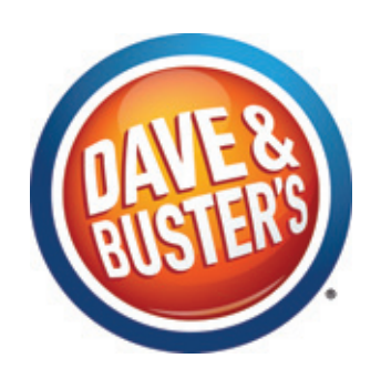
May 5, 2021